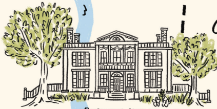
BOSCOBEL HOUSE & GARDENS