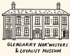
GLENGARRY NOR'WESTERS & LOYALIST MUSEUM