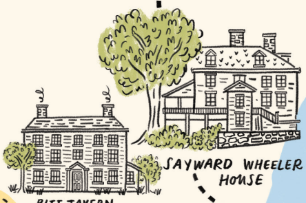
SAYWARD WHEELER HOUSE