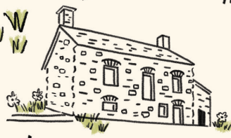
1759 VOUGHT HOUSE