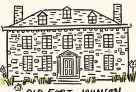
OLD FORT JOHNSON