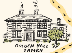
GOLDEN BALL TAVERN