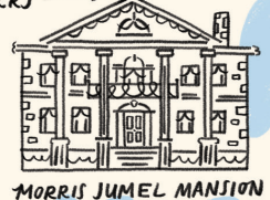
MORRIS JUMEL MANSION