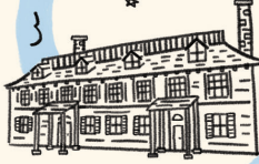
PHILIPSE MANOR HALL