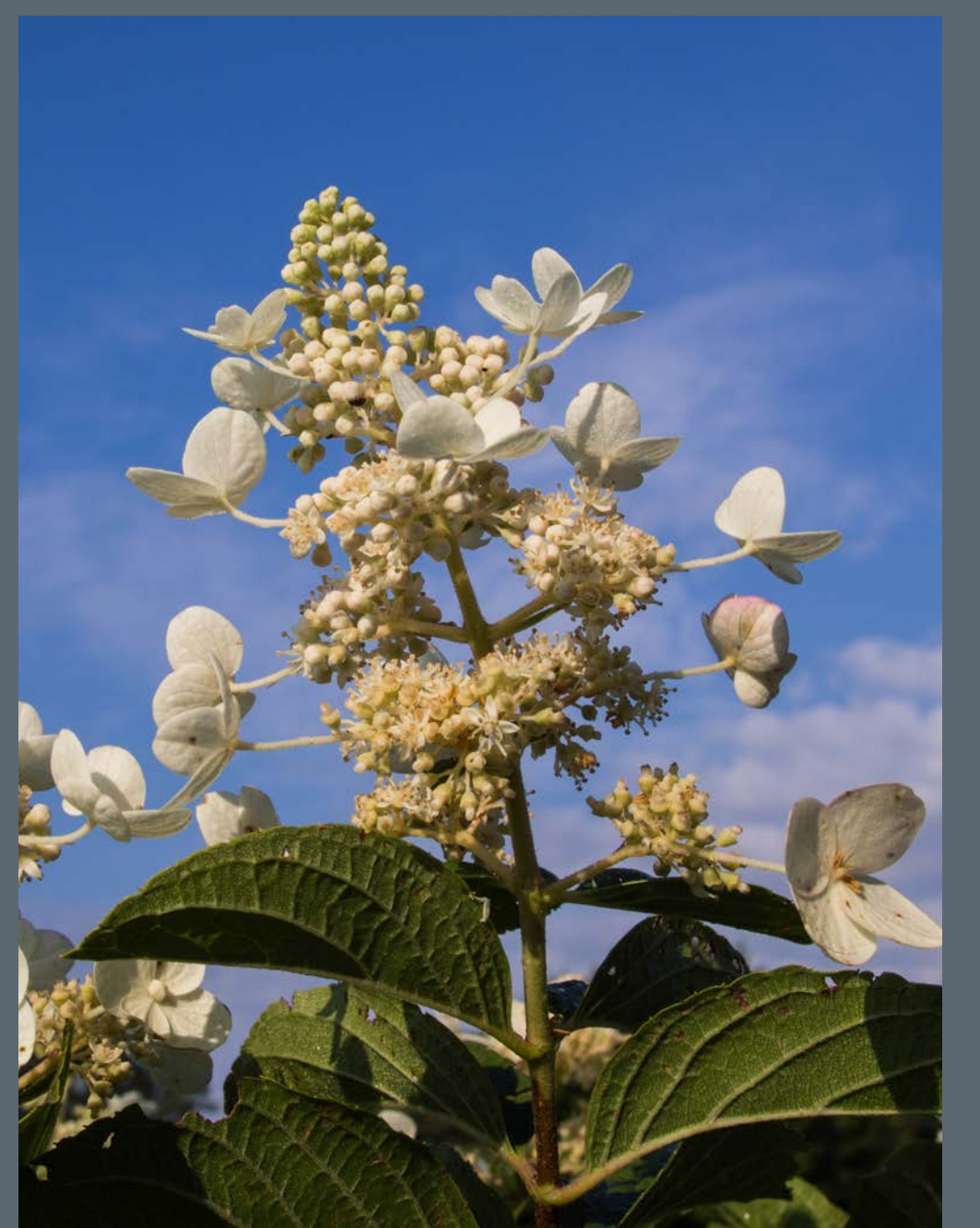
TARDIVA PANICLE HYDRANGEA Hydrangea paniculata 'Tardiva' Bloom Period: Late July to September