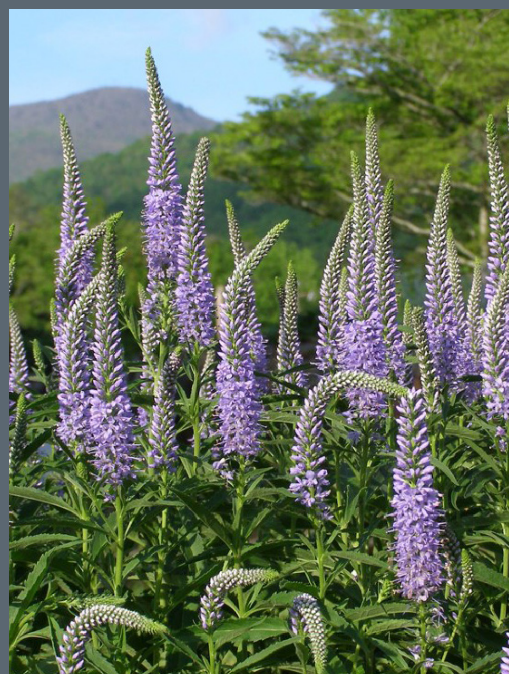
EVELINE SPEEDWELL Veronica spicata 'Eveline' Bloom Period: June to September