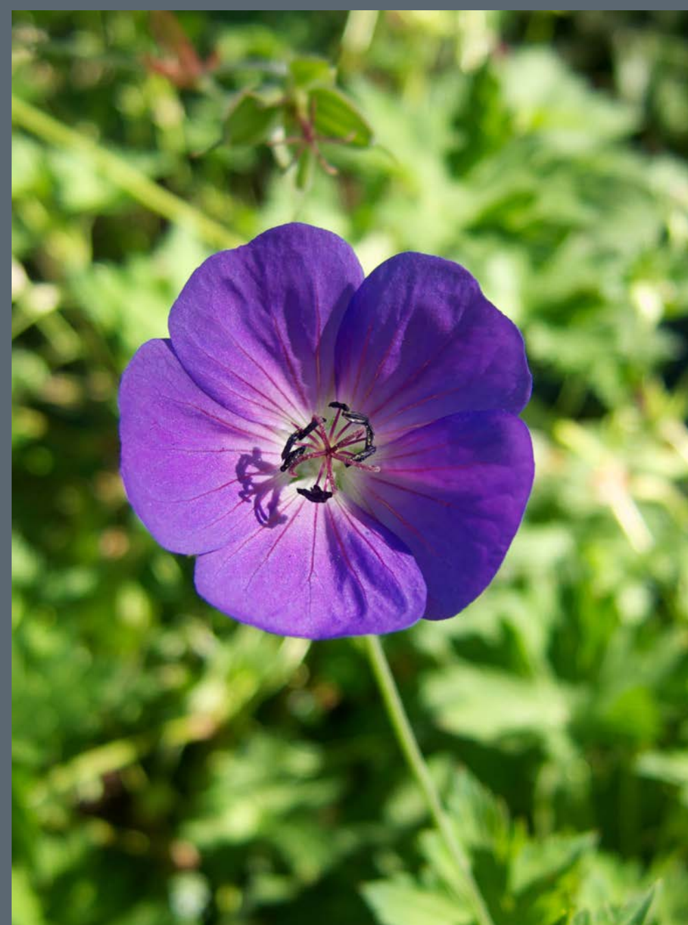
ROZANNE CRANESBILL Geranium x 'Rozanne' Bloom Period: June to September