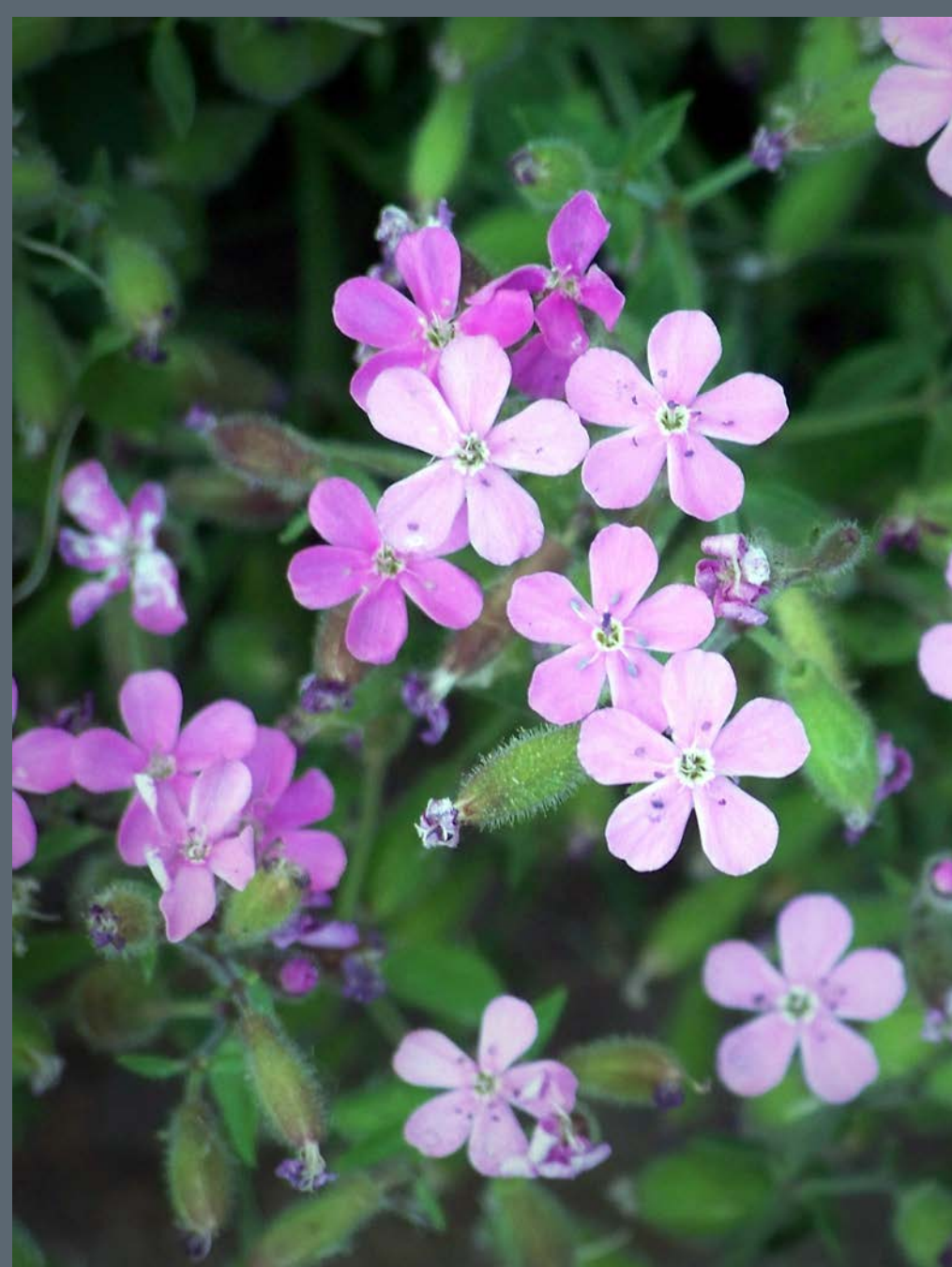
MAX FREI SOAPWORT Saponaria x lempergii 'Max Frei' Bloom Period: June to October