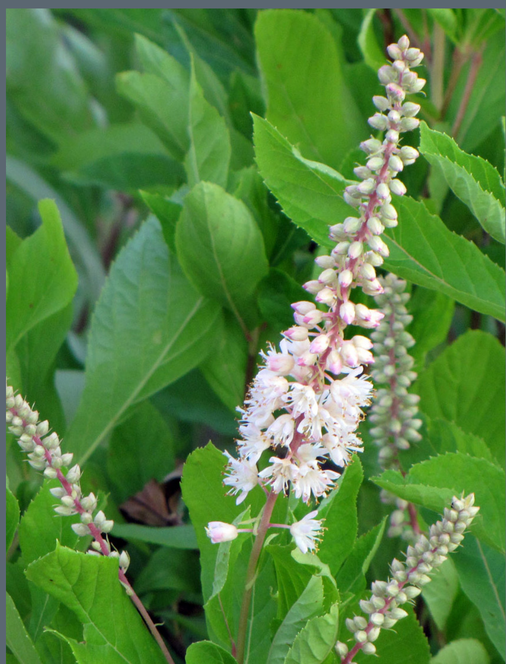
COMPACTA SUMMERSWEET Clethra alnifolia 'Compacta' Bloom Period: July to August