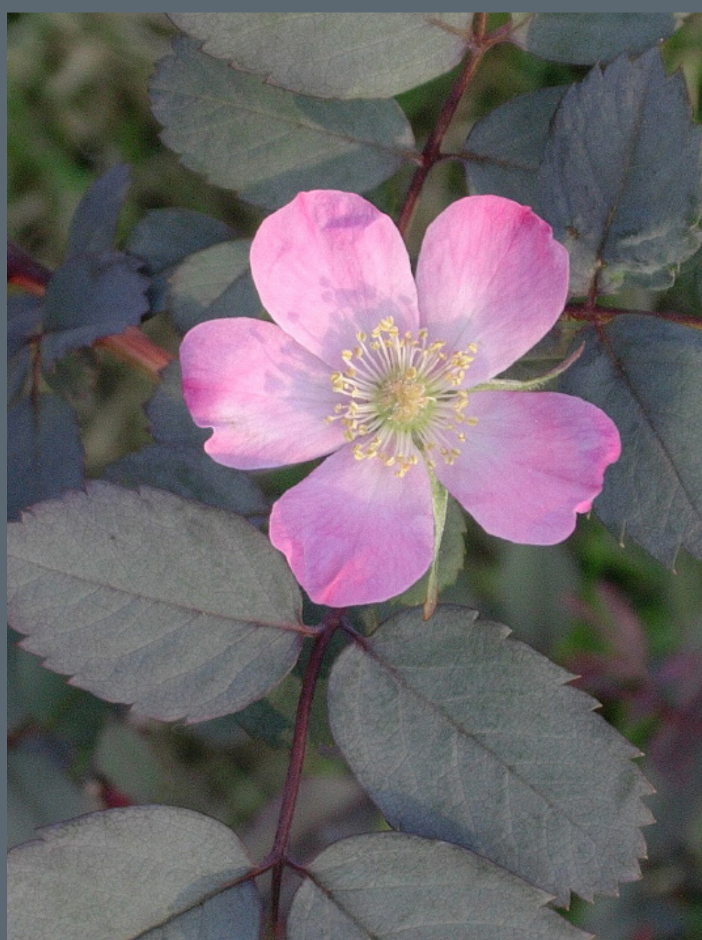
REDLEAF ROSE Rosa glauca Bloom Period: May to June