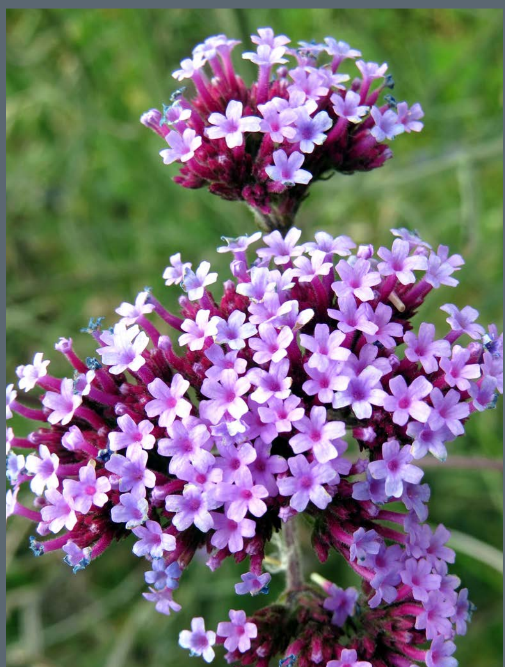
PURPLETOP VERVAIN Verbena bonariensis Bloom Period: July to August